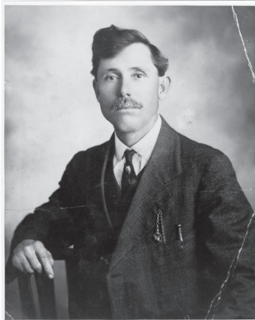
A. B. Edwards, First Mayor of the City of Sarasota, leader of the County Separation Movement.