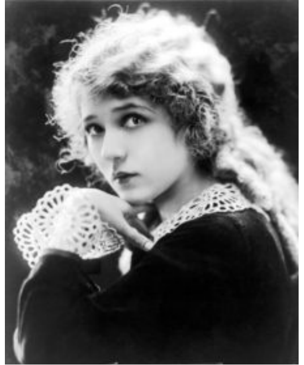
Mary Pickford, was a Canadian-American film actress and producer with a career that spanned five decades. She co-founded Pickford–Fairbanks Studios and United Artists, and was one of the 36 founders of the Academy of Motion Picture Arts and Sciences.

Due to the pandemic, the Centennial Committee has decided that instead of holding a live event in January we will be doing a number of virtual programs. One of these will be driving tours of historic sites throughout Sarasota County. The first tour should be ready by January, 2021. These auto tours will be free of charge; you will just need to download an app on your phone. More details in our next newsletter.