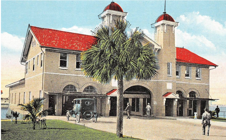
Postcard showing the Hover Arcade. In 1916 the city of Sarasota acquired the arcade building for $40,000. When Sarasota County was founded in 1921 its first offices were in the Arcade.